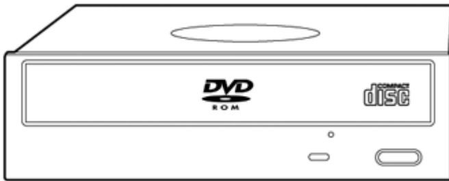
HP Half-Height SATA DVD ROM Optical Drive

The DVD ROM drive is designed to read not only CD ROM and CD R/RW discs but also DVD ROM, DVD RAM, DVD +R/RW and DVD R/RW discs.