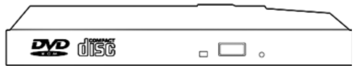
HP Slim SATA DVD ROM Optical Drive