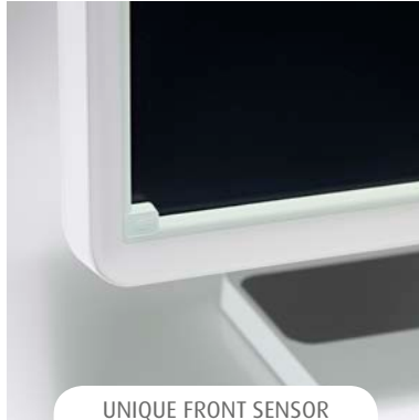
UNIQUE FRONT SENSOR