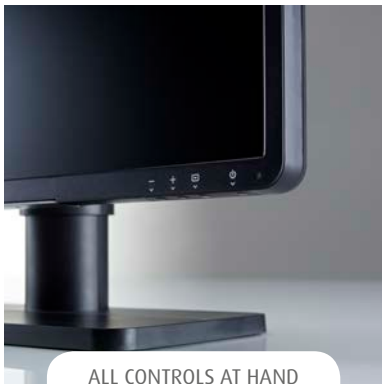
ALL CONTROLS AT HAND