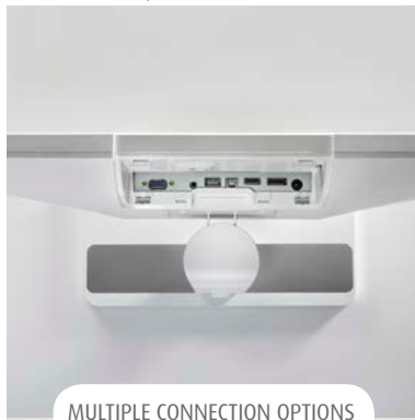
MULTIPLE CONNECTION OPTIONS

“Medical equipment surfaces can contribute to the spread of healthcare-associated infections and should therefore be disinfected.”