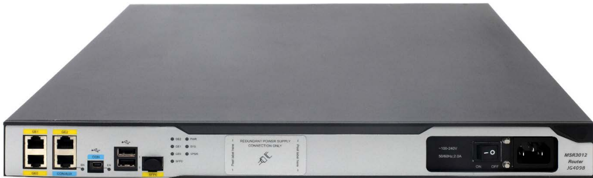
HPE FlexNetwork MSR3012 AC Router - Front

The MSR3000 series provides an agile, flexible network infrastructure that enables you to quickly adapt to changing business requirements while delivering integrated concurrent services on a single, easy-to-manage platform.