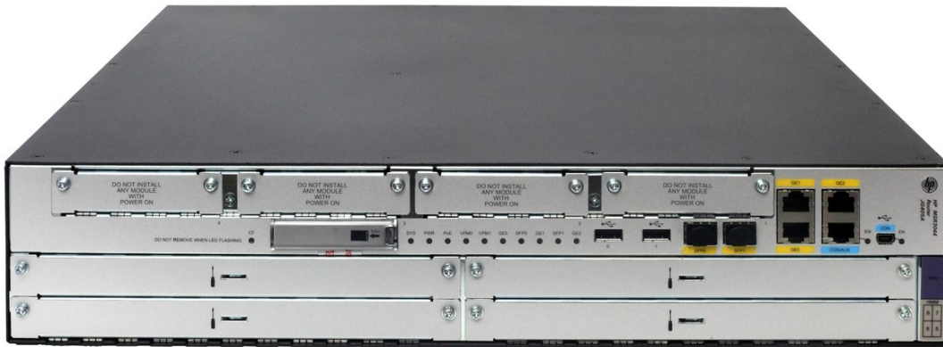
HPE FlexNetwork MSR3044 Router- Front