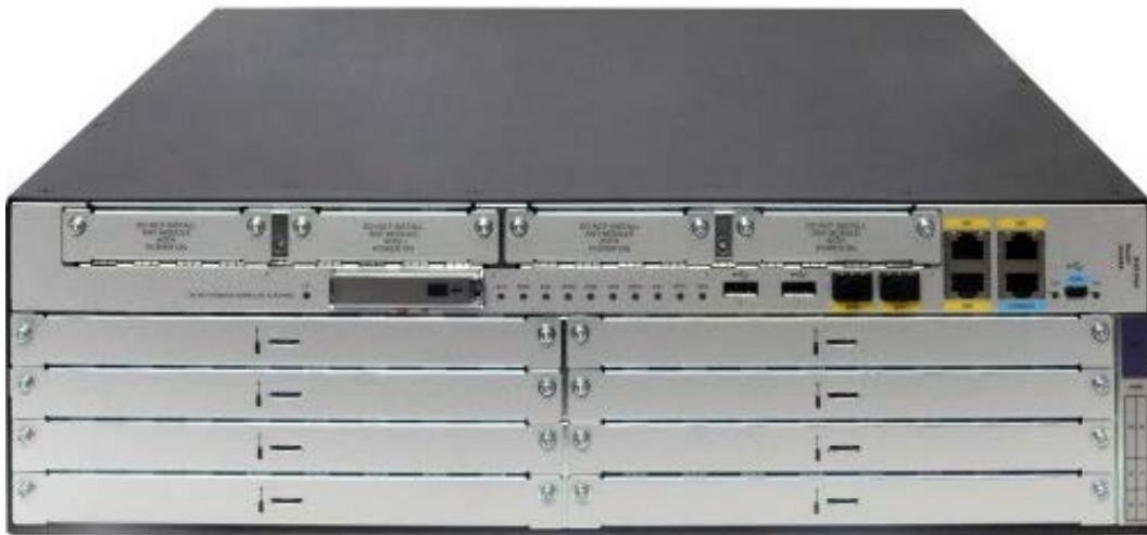
HPE FlexNetwork MSR3064 Router - Front